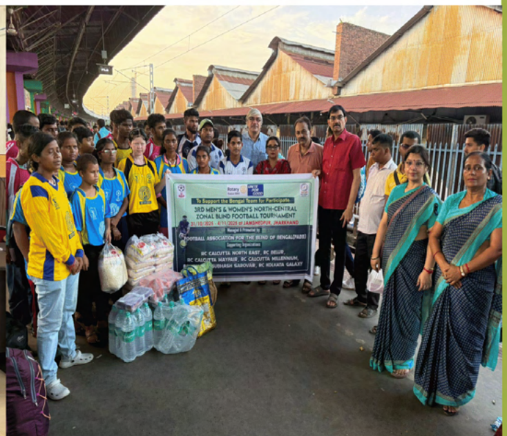
Joint Project on Sponsoring Football Team for The Blind