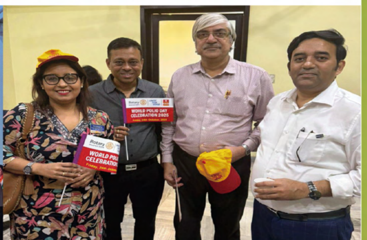
District Polio Seminar