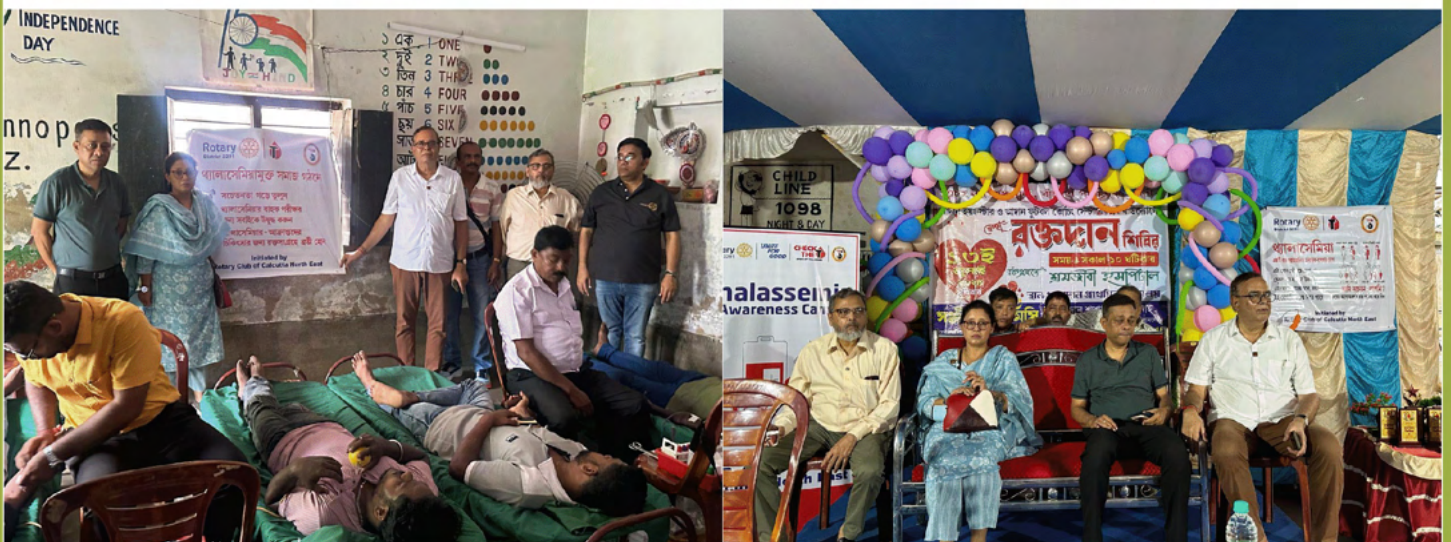
Thalassemia Awareness and Blood Donation Camp