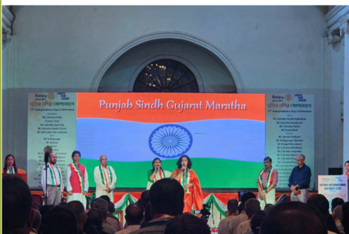
District Program on Independence Day