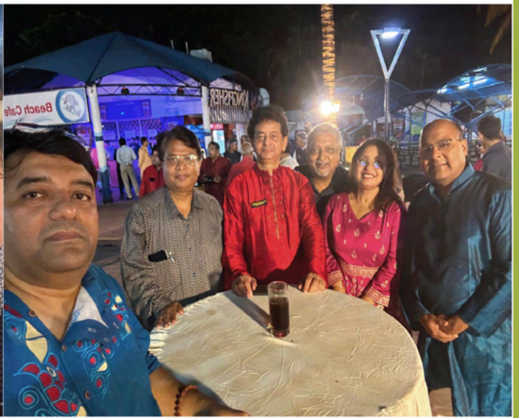
Club Members at District Bijoya Diwali Meet