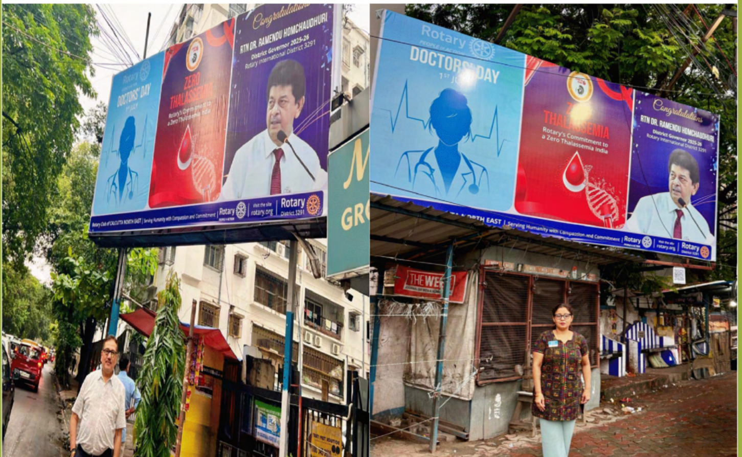
Enhancing Public Image of Rotary through Billboard Advertising