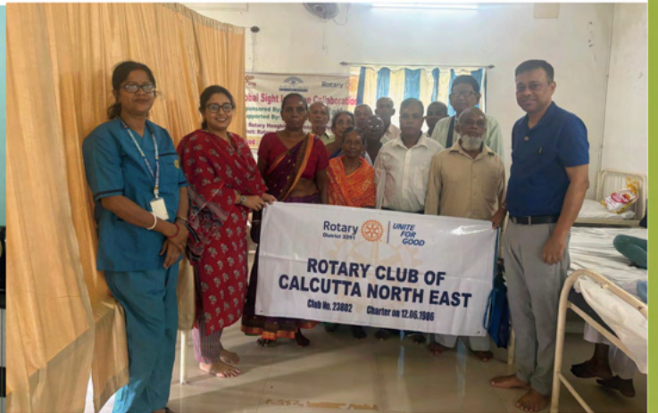
Cataract Surgery at Rotary Hooghly Eye Hospital