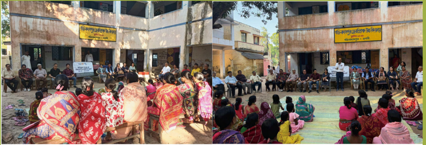
Cervical Cancer Awareness Camp at a School in Hooghly