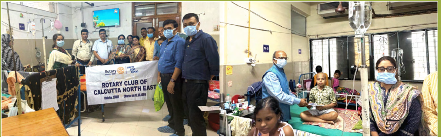
Mother and Child Care Project at NRS Hospital