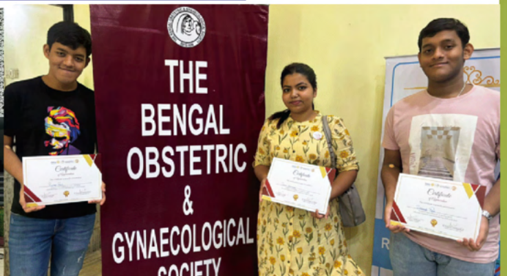
District Blood Donation Camp