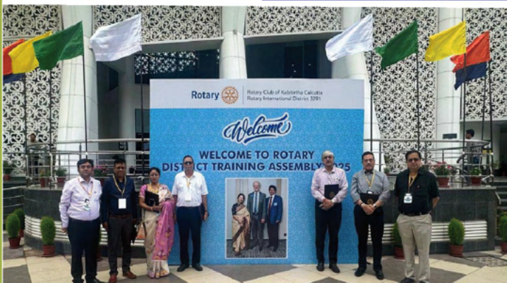
Participation at District Training Assembly