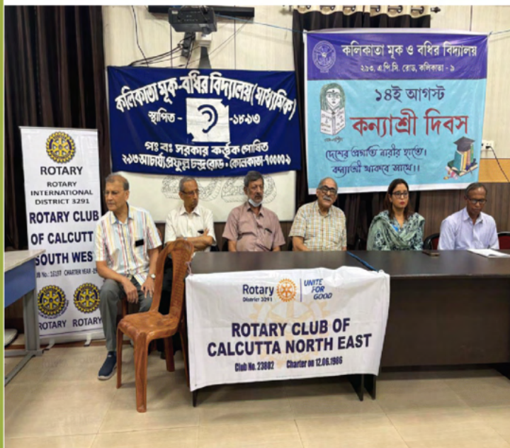
Joint Project at Deaf Dumb School