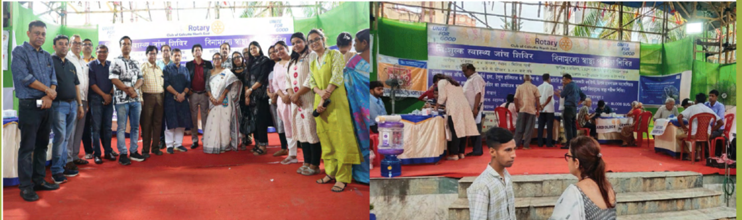
Mega Health Checkup Camp at Girish Park