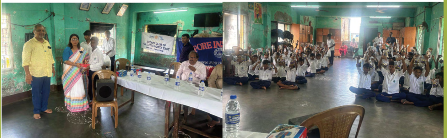
Independence Day Project at Cossipore Institution