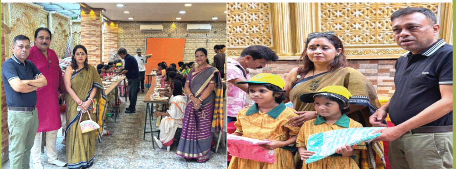
Distribution of Clothes to Children followed by Lunch