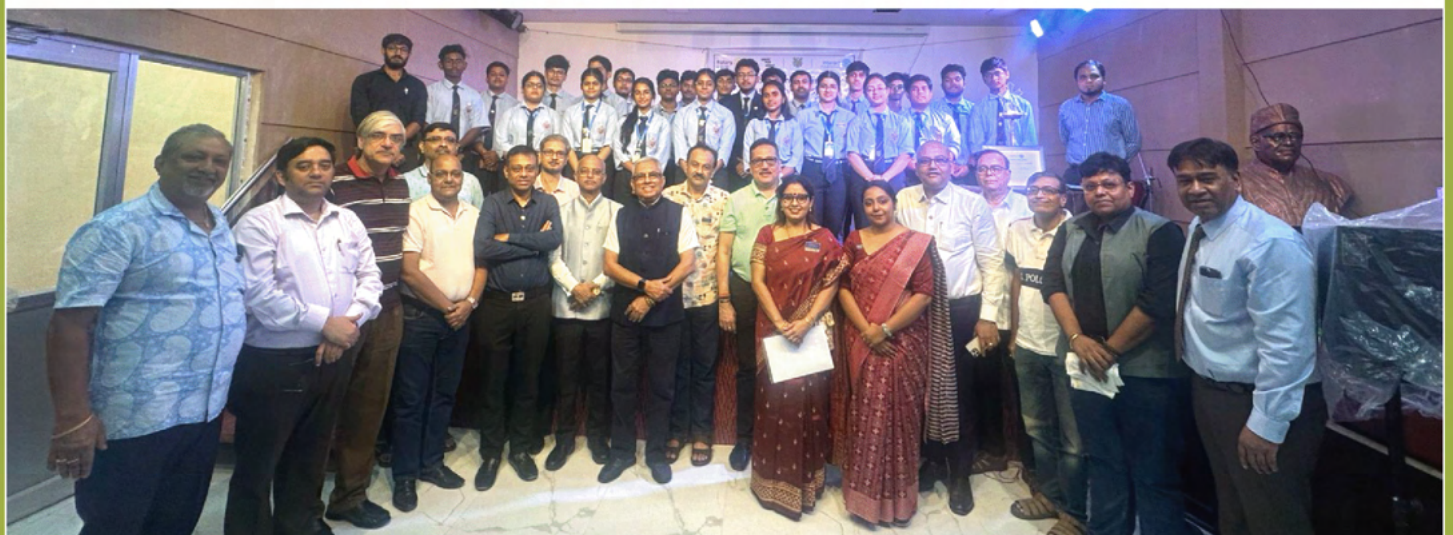
FORMATION OF INTERACT CLUB OF SCOTTISH CHURCH COLLEGIATE SCHOOL